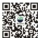
Scan for video