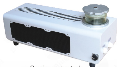
Cooling water tank