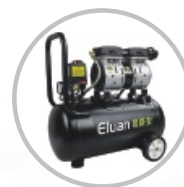
Dry Air Generator